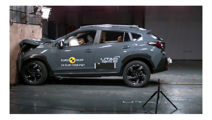
Euro NCAP Logo 5 Stars for Test 2024